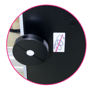
Manual X cutting angle correction – the X cutting edge can be corrected manually to match the exact cutting marks on the print after it's