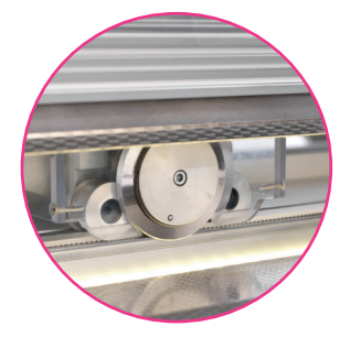
Self-sharpening X cutting blade with a counter blade Two diameters of blade are available depending on the media to be cut. Blades are very easy and quick to change by the operator and are affordably priced.

X cutting tolerance is at +/-1mm (1/32") on the entire width.