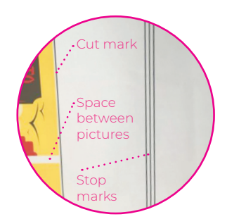
Cut marks can be generated specifically in SAI or Caldera software, and more generally with all other RIPs.