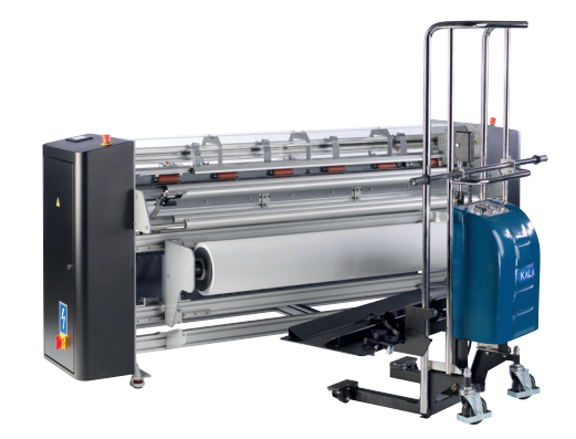
For roll lifters ask us about our RollJack