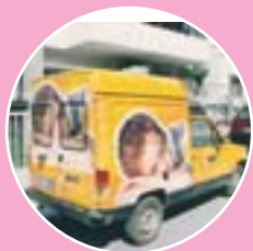
Creative applications with Sirocco 1080